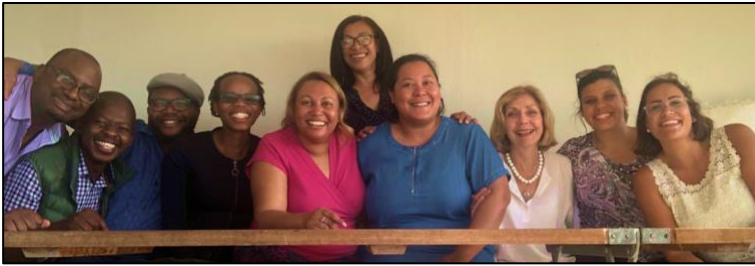
Some of the JustLead! team at a planning workshop.

throughout South Africa is a first for Stellenbosch University. I have worked collaboratively with the Leadership Academy at Stellenbosch University to align our respective visions and to use academic